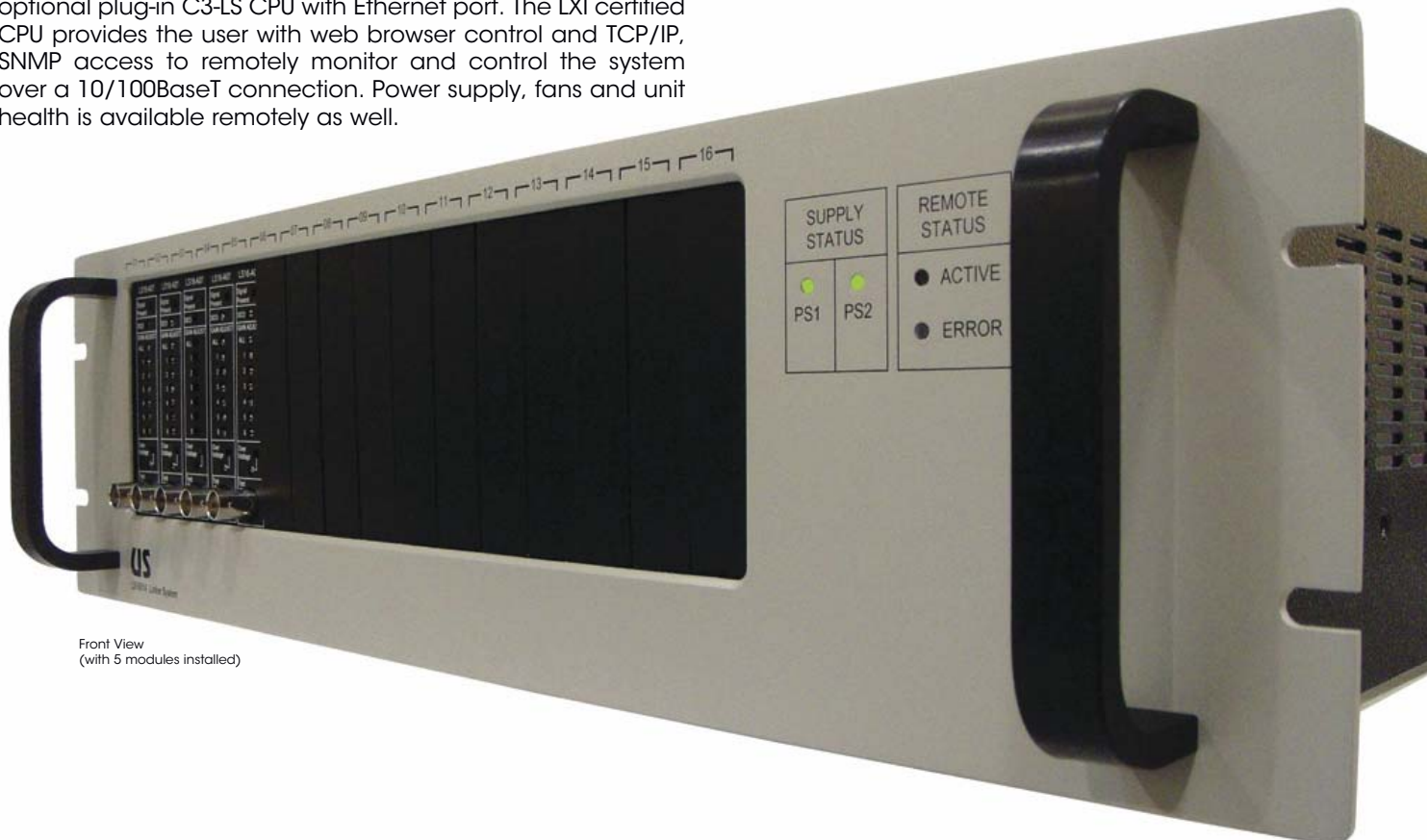
Front View (with 5 modules installed)