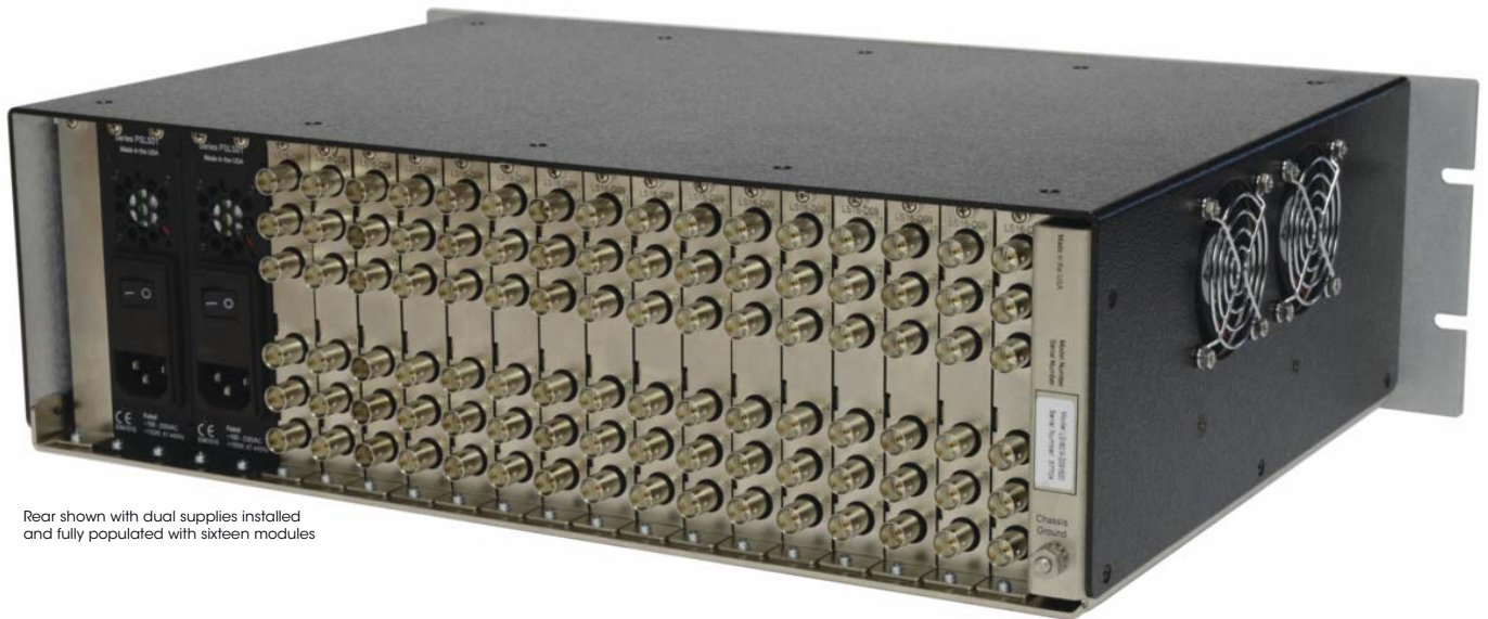
Rear shown with dual supplies installed and fully populated with sixteen modules

Shown below is the standard LS1601A mainframe unit configured with dual power supplies and the optional M&C CPU assembly, and two modules installed. Filler plates have been installed to complete the unit.